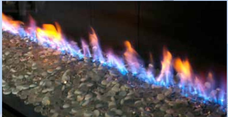
C-View R620 Natural Gas Residential fireplace with designer glass beads